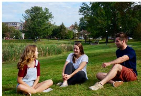
Pictured on the right: Undergraduate students from Elementary French by Mirror Lake, Storrs Campus.