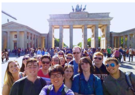
UConn's Eurotech class at the Brandenburg Gate in Berlin, Germany

With the opening of the fourth dual-degree engineering program in the fall of 2018, LCL turns an important corner, with the development of a suite of programs under the new rubric of International Engineering. What this means is that instead of coming to UConn for an amazing niche program—traditionally the Eurotech in German—students will now be coming to a destination program at UConn on par with the Honors Program. This has involved a massive outreach campaign at every level of the university.