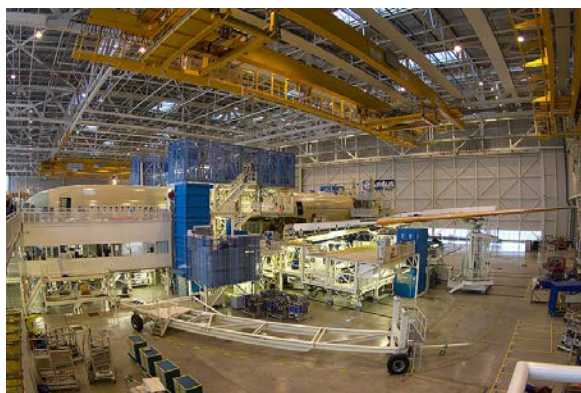
Airbus facility in Toulouse, France

Currently there are 150 students in the International Engineering programs: 100 in Eurotech; 40 in Spanish; and 10 in Chinese. The French program, which opens officially in the fall of 2018, already has five students enrolled. We expect, following the examples of the handful of other universities that have adopted this strategy, that by becoming a destination program at UConn, that all of the International Engineering programs will expand. In five years, we anticipate that we will be recruiting 300 students.